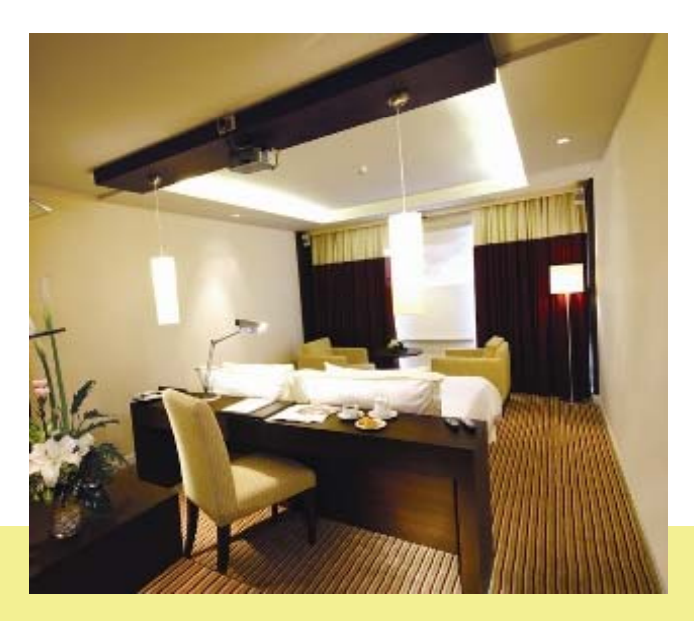
SUPERIOR (28 sqm)

A fresh design reflecting a modern lifestyle. Our Superior rooms are fully equipped with necessary amenities, internet, IDD telephone, tea and coffee making facilities, in room entertainment systems and a deluxe TV channel selections.