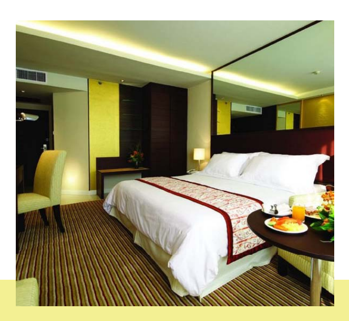
DELUXE (30 sqm)

All of our Deluxe rooms are on higher floors and fully equipped with deluxe amenities, internet, IDD telephone, tea and coffee making facilities, in room entertainment systems and a deluxe TV channel selections.